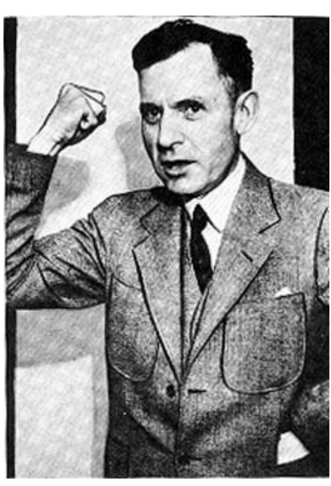
Homer T. Bone, 1932