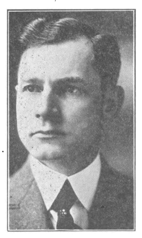
HON. HOMER T. BONE Author of the "Bone Power Bill"

"We condemn the Reed bill as a measure favorable to the private power interests. On the other hand, we heartily favor the enactment of initiative bill No. 52, known as the 'free power (Bone) bill'".